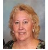
Margaret Hill Philanthropy

Believe it or not there is STILL time!!!!